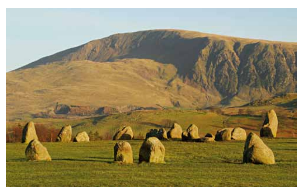
The Castlerigg Stone Circle was probably constructed more than 5,000 years ago and nobody knows its real purpose. The stone circle, or rather an oval, is about 30 m wide, with the tallest stone being more than 2 m high.