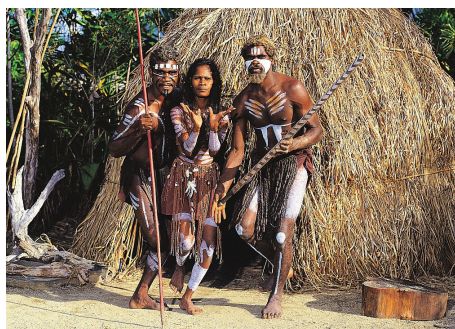
Aboriginal peoples lived in Australia before the arrival of Europeans.

the lifestyle of the indigenous people and many became sick from new illnesses and died.