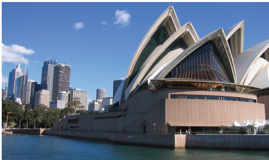
The Sydney Opera House is one of the most distinctive and famous 20th century buildings in the world. The building and its surroundings form a typical Australian image.

The Australian flag is dark blue, with the flag of the United Kingdom in the upper left hand corner. The lower left hand corner contains a seven pointed star known as the Commonwealth Star. Each of the star's points represents one of the six sovereign states, and the seventh point represents all of the territories. The rest of the flag is a picture of the Southern Cross constellation , which can only be seen in the southern hemisphere . It has one small star and four larger ones.