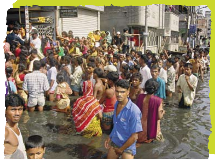
Rainfalls cause disastrous flooding in Bangladesh.

Businesses like the Best Workplaces plan because it helps them save money in unexpected ways. For example, large companies which have problems finding enough parking spaces for