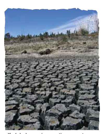
If global warming continues, extreme droughts can turn some areas into deserts.

With all these scary predictions, it is no wonder more and more people are trying to support efforts to reduce global warming.